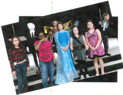
Students in costume for Halloween.